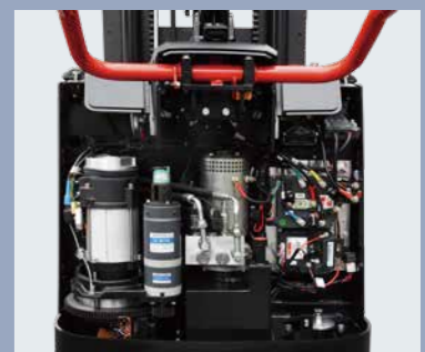
Back cover can be opened fully, and all components and parts are clear at a glance, which is very convenient for maintenance of the entire machine