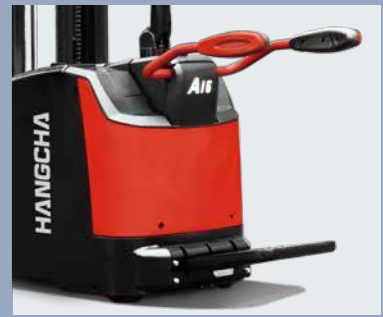
The integrated stamping molded guardrail offers better protection for the operator