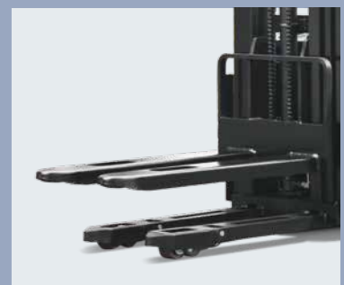
Tandem load wheel